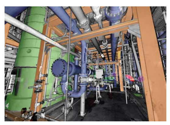
LFM is driven by the BubbleView<sup>®</sup>. Make annotations and measurements, create 3D models and view clashes in the BubbleView<sup>®</sup>.

Visit us online: www.lfm-software.com | Or call +44 161 8690450