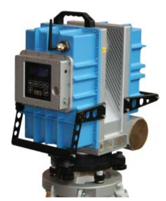
Explosion proof: IMAGER 5006EX