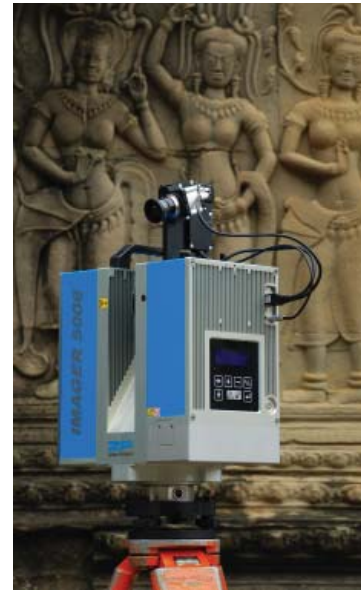
In operation in Angkor Wat: Z+F IMAGER 5006i

The relationship to costumers and partners is most important for Zoller + Fröhlich. Users worldwide appreciate our personal service and technical support. Today Zoller + Fröhlich is one of the leading enterprises in the field of contact-free laser measuring technology. Thanks to years of practise and countless concluded projects, we built a wealth of experience and success. At present, Zoller + Fröhlich is represented in 40 different countries with branches in England and USA, and many sales co-operations throughout the world. The success of Zoller + Fröhlich can be attributed to first-class service and personal advice.